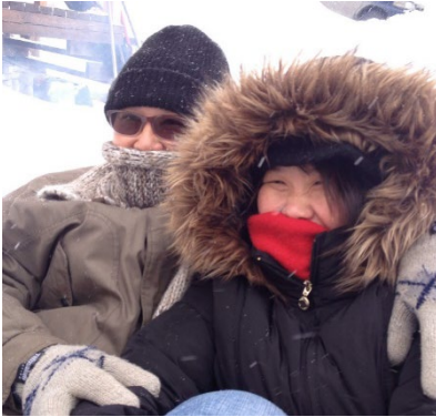
Trip to Russia (Khabarovsk) for Ministry to CMBC Russia (2015)