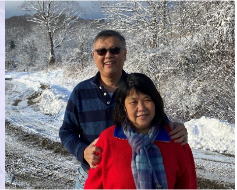
Vermont, USA 2021